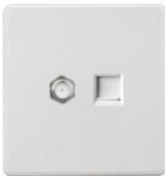
Satellite and TEL socket