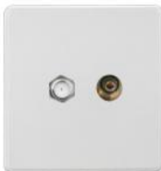
Satellite and TV socket