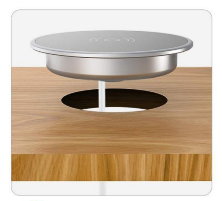
2 Screw it in under the table