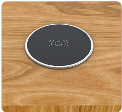
Finsh installation remove the protective film