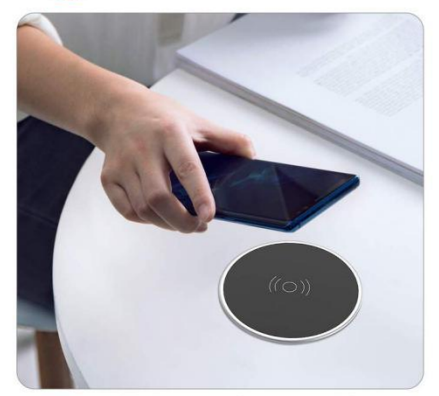
Put your phone on the charger start charging