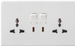
Double switched socket with neon

13A/250V~ 10pcs/box 100pcs/ctn 49.5x31.5x20cm 3