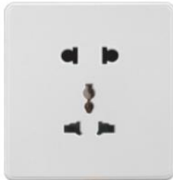
5 pin universal socket

13A/250V~ 10pcs/box 100pcs/ctn 49.5x31.5x20cm 3