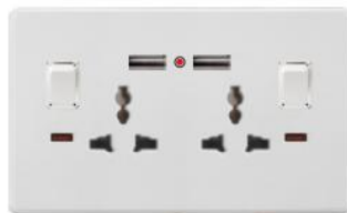
MF 2x13A socket with 2 USB Port KC1-049

13A/250V~ 10pcs/box 100pcs/ctn 49.5x31.5x20cm 3