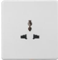
3 pin universal socket