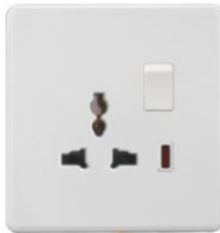
Switched socket with neon KC1-012

13A/250V~ 10pcs/box 100pcs/ctn 49.5x31.5x20cm 3