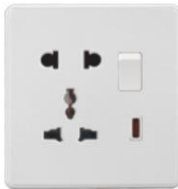
Switched socket with neon KC1-015

13A/250V~ 10pcs/box 100pcs/ctn 49.5x31.5x20cm 3