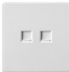
2 Computer Socket 2 TEL Socket TEL+Computer Socket