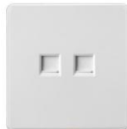
KC1-021 KC1-022 KC1-023

ADD: 152 xinguang industrial zone, yueqing city, zhejiang province