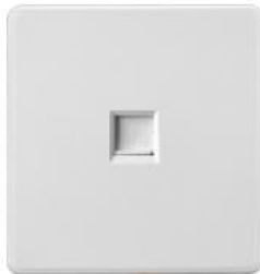
Computer Socket TEL Socket