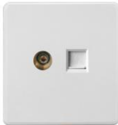
TV+TEL Socket TV+Computer Socket