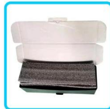
Cylindrical socket with paper box