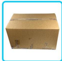
Socket with kraft paper