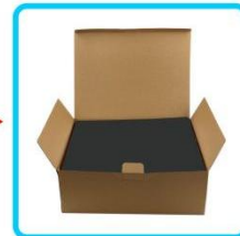
Boxes with kraft paper