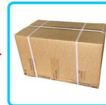
Packing PP belt product outer box