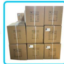
Put to pallet