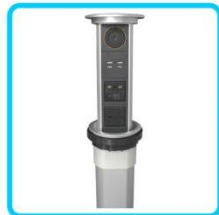
Access cylindrical socket