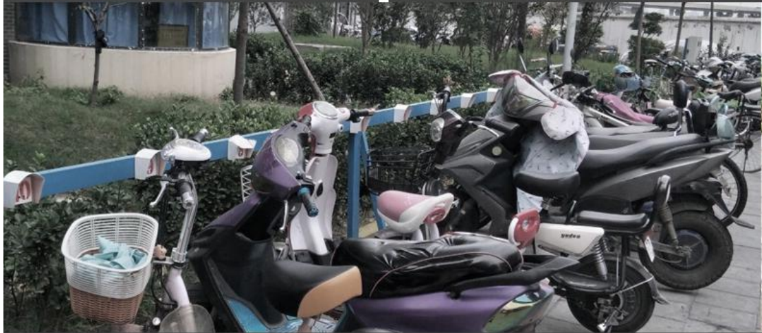
Charging pile of battery car